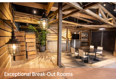
Exceptional Break-Out Rooms