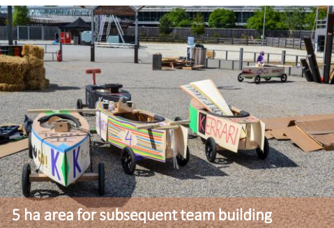
5 ha area for subsequent team building